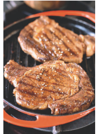
A 2cm thick steak only needs three minutes each side for rare

Now, we're ready to go. The minute your steak hits the griddle, it will begin to colour