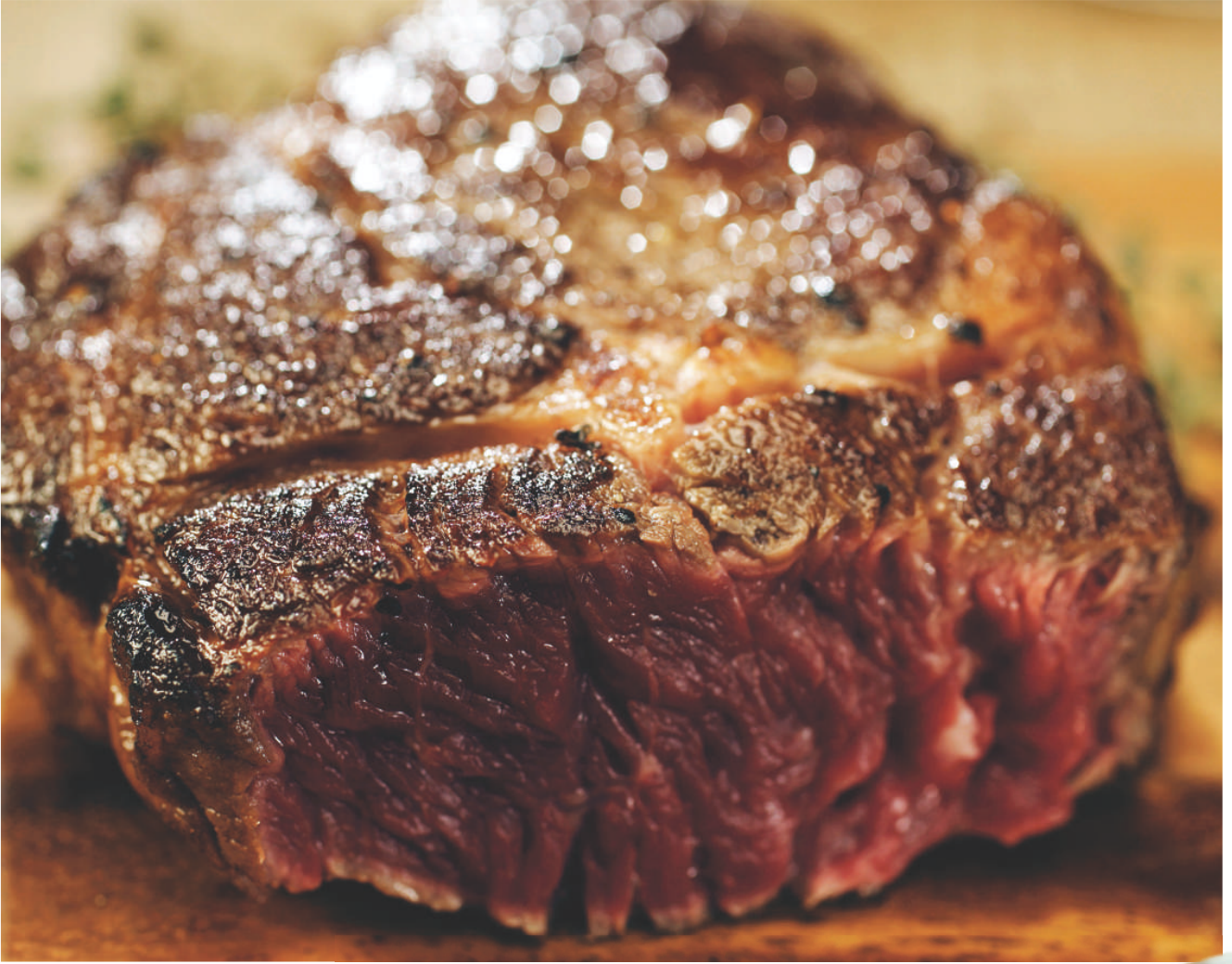
Above Made to make your mouth water: a perfectly cooked succulent British steak. Beef from our native cattle breeds is the best in the world